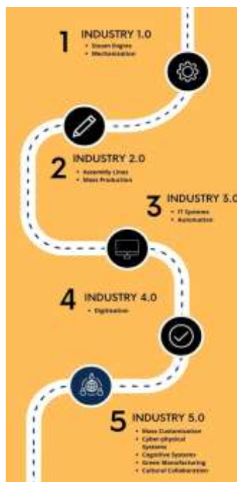
Figure 1. Evolution of Industry 5.0.

By integrating human experience with AI, Industry 5.0 can build precise control and cognitive capabilities. The vision for Industry 5.0 has been established by expertise based on control, intelligent behavior, and manufactured principles. The goal of Industry 5.0 is to enable robots to execute laborious and repetitive activities, freeing up human labour for jobs which require intelligence and critical thought. This will improve the quality of output. By automating tedious and repetitive processes, Industry 5.0 aims to increase the quality of production while freeing up labor to focus on critical thinking and intelligent jobs. It would produce a niche market for skilled people. In the mass customization-focused Industry 5.0, humans will operate robots. CPS is closely related to Industry 5.0, which involves humans and robots interacting collaboratively. The fundamental building blocks of process management would be collaborative robots, or cobots. Also, it would be greener because the emphasis would be on sustainability development and manufacturing [2,3] .