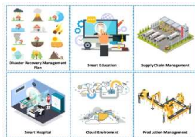
Figure 3. Applications of Industry 5.0.

Human engagement and automated, intelligent digital ecosystems are intended to be combined in Industry 5.0. In this method, human factors are used in order to create customized end-user experiences and effective workflows. A complete description of such future research [35,36] is depicted in Figure 3 .