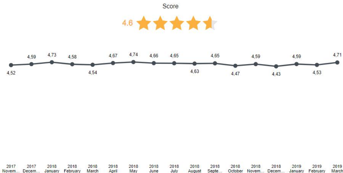
Figure 5. The overall result and the average over time of the customer satisfaction survey, extracted from the HR performance report.

changes need to be made in business operations to increase overall satisfaction of customers [6] . An important factor to ensure that services are being delivered not just within the agreed time but also with satisfactory quality. Results (see Figure 5 ) can be analyzed over time since it was implemented.