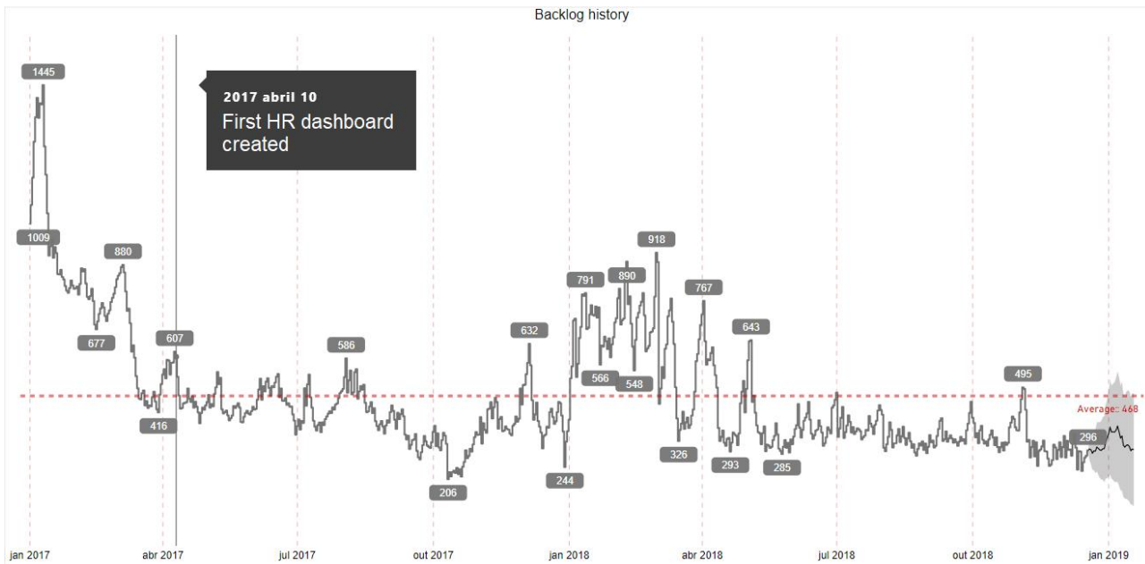
Figure 3. The backlog of requests that HR had day-by-day, extracted from the HR performance report.