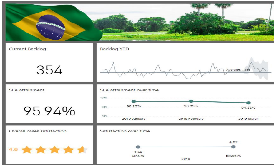
Figure 1. A sample of BI dashboard utilized by HR to follow up on KPIs, performance and quality metrics.

A business intelligence dashboard (see Figure 1 ) is an information management tool that is used to track KPIs, metrics, and other key data points relevant to a business, department, or specific process. Through the use of data visualizations, dashboards simplify complex data sets to provide users with at a glance awareness of current performance [2] .