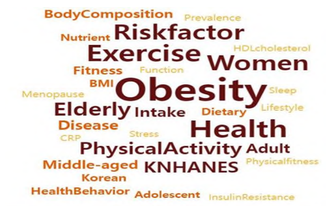
Figure 2. Wordcloud for metabolic syndrome related keywords.

Keywords related to metabolic syndrome were collected and refined using the KCI journal database provided by the NRF (National Research Foundation) in Korea; among them, the top 56 keywords (frequency of occurrence of 11 or more) were selected as the subject of final network analysis. A visualization of the top 30 keywords using Wordcloud is presented in Figure 2 .